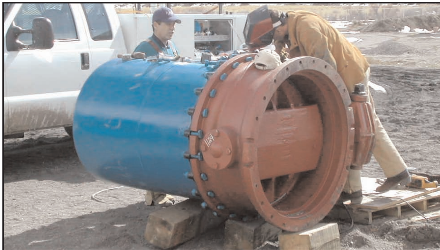
Working on a valve cluster for the new Chloramination Project. Project 7 Water Treatment Plant

PLEASE CALL before YOU dig! 1-800-922-1987 for all underground utilities.